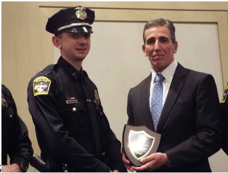
LUCIANO AWARD WINNERS